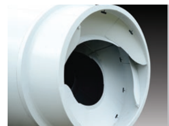
LARGER FIN DESIGN WITH 47" PAVER DISCHARGE OPENING