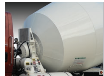
LEGENDARY CONTINENTAL DRUM